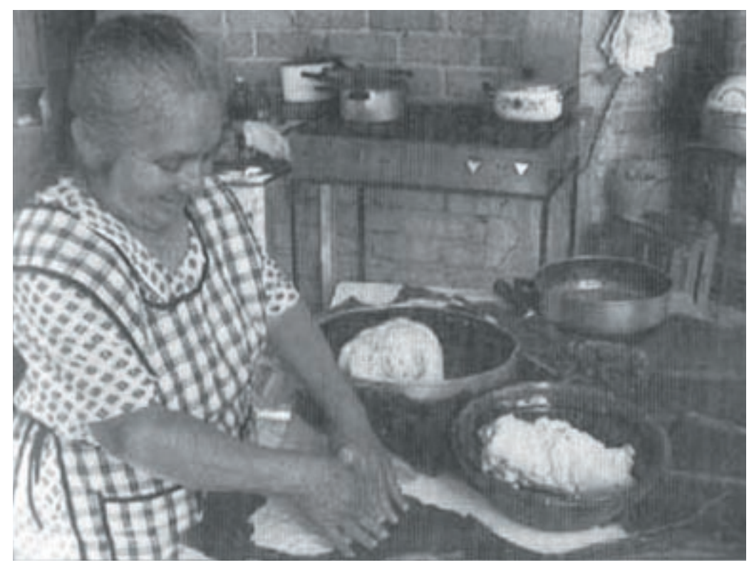
Elder culinary instructor preparing tamales.