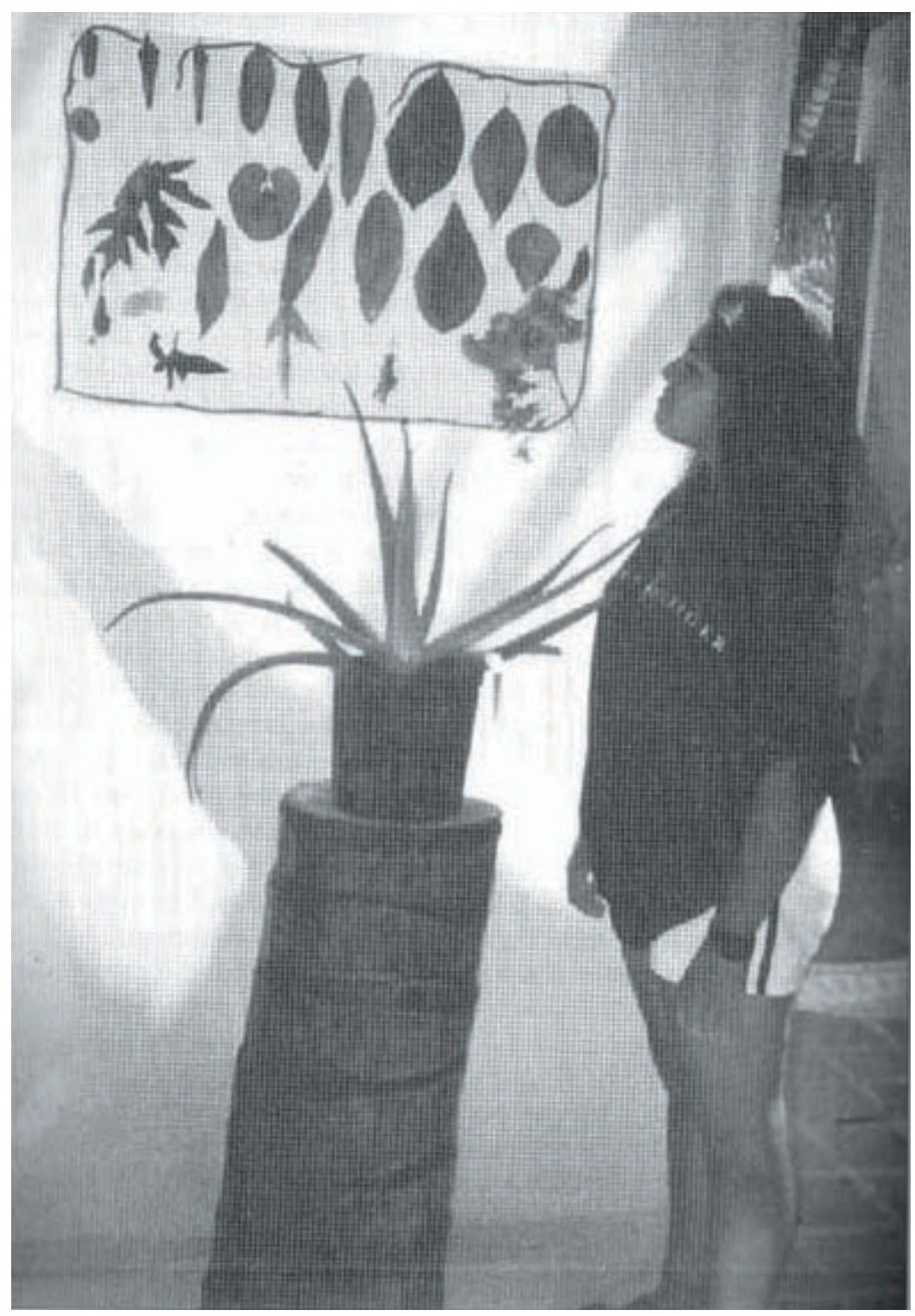
Culinary instructior viewing the Center's display of local plants.

as the mid 1980s stocked the drug on front shelves when it was supposed to have been withdrawn from the worldwide markets by Ciba Geigy, the manufacturer.