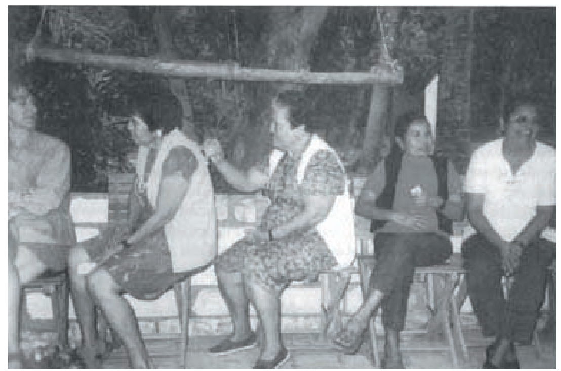
Sharing polarity therapy and massage techniques.

medical traditions from India and the cranial Osteopathy from early 20th century "drugless medicine practitioners. (Korn 2000). It is an art and science of healing, which brings balance to the human energy field by hands-on manipulation of bones, soft tissue and energy points; nutritional and attitudinal counseling; and specific stretching exercises using sound and movement. Polairty therapy and other massage modalities proved harmonizing with curanderismo (Goldwater 1983), known to the villagers, and practiced under the radar of the physicians with whom the few wealthier, Catholic church-going community members traveled to the city to consult. These methods link to traditions dating back to Greco-Roman natural medicine, which is a major arm of the syncretic tradition of curanderismo, (Davidow 1999; Trotter et al 1997), active in its many forms throughout Mexico and the Indigenous populations in the southwest USA.