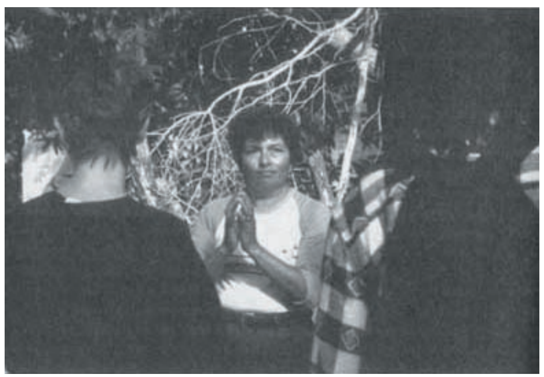
Local faculty teaching visiting students about medicinal plants.

women and children at the front and center of our work and apply a feminist analysis of health in the context of power, cultures and societies. In addition to members of the comunidad, who serve as staff, educators and the recipients of our services, the center has received indigenous academics, healers and researchers from urban and rural centers around Mexico including Oaxaca and Puebla and from around the world, including aboriginal people from Australia and New Zealand, First Nations people from Canada, and European indigenous representatives such as, the Sapmelas (Sami) of Finland and from Sierra Leone, Africa.