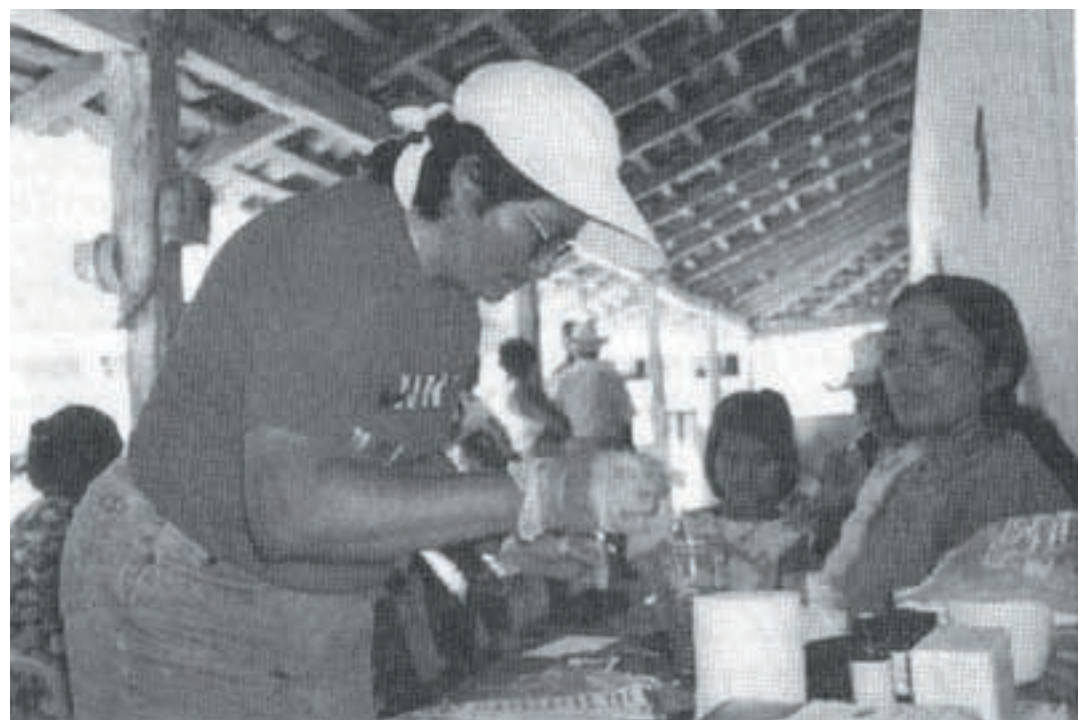
Health promoters visit mountain villages to rest blood glucose.

pace of life increased along with stress-related disorders. White bread sandwiches with cut-off crusts, replaced corn tortillas.. Children and young adults came in to the clinic with high blood pressure, high blood sugar, insomnia, (often due to over-consumption of Coca Cola and other commercially produced sugar water products) allergies, and diabetes. An epidemic of chronic diseases was unfolding.