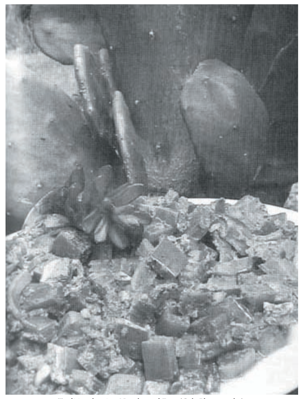
Traditional recipe: Nopales and Eggs.

insomnia. From there, we were able to explore the possible causes of insomnia, which we found was a good marker for stress.