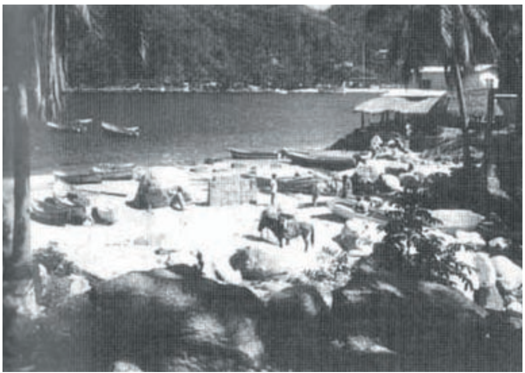
The little beach receiving cargo, 1975.

diet, herbs and nutrients. These and many others demonstrated the value and success of our approach to healing.